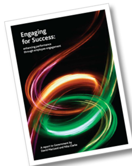
MacLeod Report on Employee Engagement

One approach protecting this critical investment is to proactively use employee surveys to understand what the key motivators and dis-satisfiers are for employees within an organization overall and among its major subgroups (such as divisions, business units or departments). An effectively-designed employee survey can help any organization - whether for profit or not-for-profit - learn what most excites their employees and what turns them off. Employee surveys can highlight where an organization performs well and where it falls short of employee expectations. Why is this information so important? Because of the direct impact that committed and loyal employees have on an organization's success, performance and profitability.